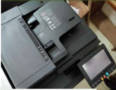
DIGITAL PHOTOCOPIER MACHINE